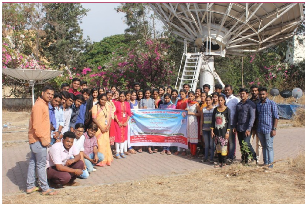
Industrial visit to Institute of Satellite Telecommunication Pvt. Ltd Pune.