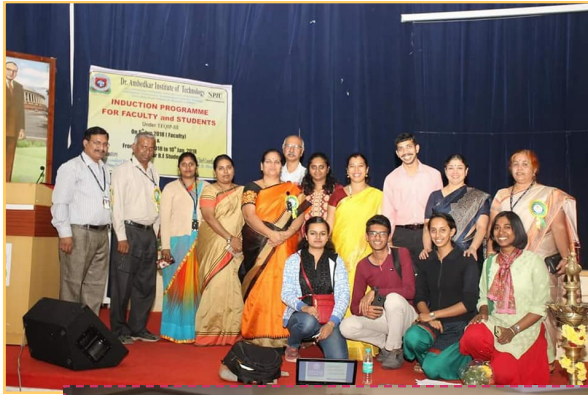
Glimpse of the various student activities during the induction training.