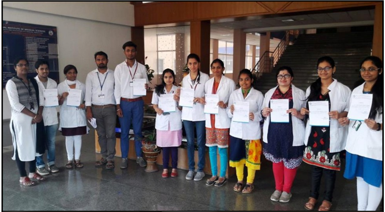
6th semester students at National Institute of Mental Health & Neuroscience– NIMHANS– Bangalore during 27th & 28th Feb. 2018