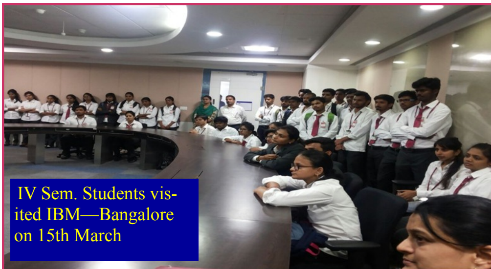
IV Sem. Students visited IBM—Bangalore on 15th March